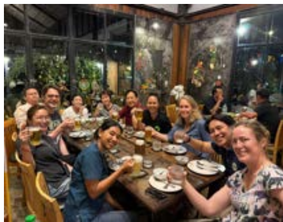
The speakers and STEF Veterinary Centre team sitting down to a meal after the course

At the end of the lectures, we took the delegates to the STEF Veterinary Centre to see the facilities. Of our four inpatients present, one 25-year-old elephant is undergoing treatment for a neurologic condition, believed to be a result of eating foliage close to the edge of a crop which had been recently sprayed with a pesticide. Eating plant material contaminated with pesticide has caused nerve paralysis, and the elephant is unable to use her trunk to eat or drink and has loss of use of many of her facial muscles also. She had become very thin and weak. Over the past month's stay at the hospital she has shown improvement but still requires support from two slings to allow her to stay on her feet. She is also being hand fed and watered, while her trunk regains its function. We are indebted to the Jean Sainsbury Animal Welfare Trust, The