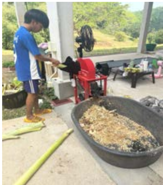
The Mahout is shredding sugar cane and mixing it with oats and dates to hand feed her

I'd like to take this opportunity to highlight our challenge events, in case you or a friend feel inspired, - why not take a look!