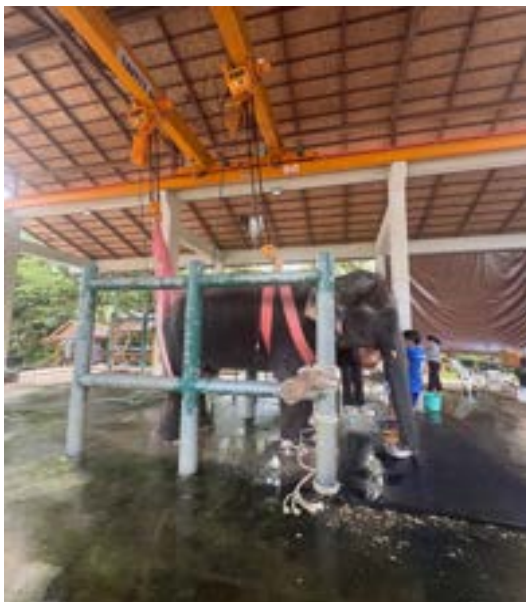
Both hoists working well to support each end of this elephant, to enable her to stand

Michael and Shirley Hunt Charitable Trust and to the Animal Defence Trust for awarding STEF grants for this specific equipment, which was only installed in December.