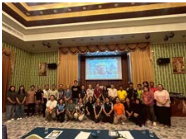
Conference delegates at the Erawan Hotel, Khok Kloi

Attendees were a mix of local university department heads, veterinary students, local vets, mahouts and elephant owners. Two national park officers attended too and were very pleased with the day. General feedback was very positive, although the background to EEHV science was for some a bit complex. More courses were requested, especially with a focus on elephant management and husbandry, such as foot care.